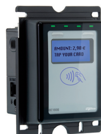
Ingenico contactless reader IUC180