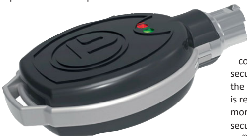
SuzoHapp's E-PRL lock

“These keys can be tracked using our software to better find inaccuracies and are also able to be remotely and instantly reprogrammed and turned on/off in case of employee turnover or a lost key. This extra measure will give any security operator that extra peace of mind to know that